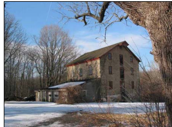
Ralston Cider Mill, Mendham Township