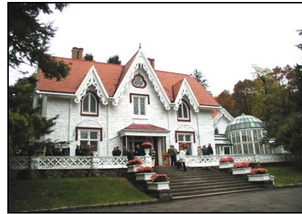
Glen Alpin, Harding Township

The survey is currently being updated by staff of the Morris County Preservation Trust. This update incorporates the use of county GIS and will take a number of years to complete due to the level of detail and documentation being recorded. When finished, it will form the basis for an update of the Historic Preservation Element of the Morris County Master Plan.