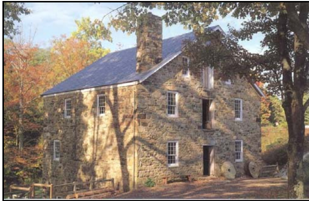
Cooper Mill, Black River County Park Chester Township

Many municipalities in Morris County also fund historic preservation activities through their municipal open space tax. Of the 29 municipalities in Morris County that have a dedicated open space tax, 13 allow the use of the tax for historic preservation purposes. 7