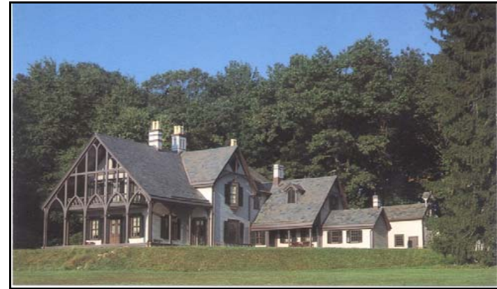
The Willows at Fosterfields, Morris Township