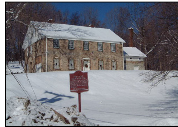
Ford-Faesch House, Rockaway Township

A wide variety of historic sites and structures are funded under this program. Historic homes and farmhouses/farmsteads are most prevalent with other grants going to preserve or maintain such