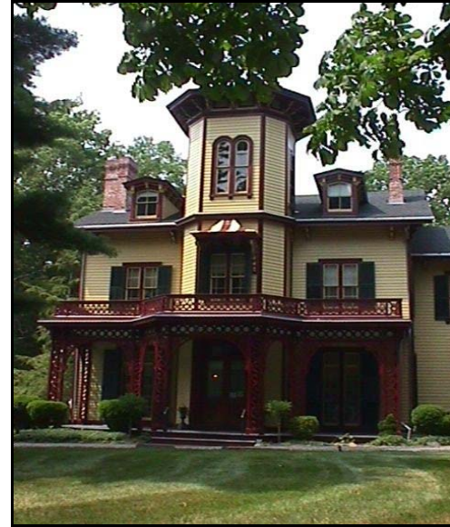
Acorn Hall, Morristown