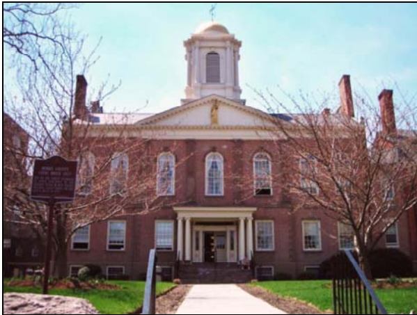
Morris County Courthouse, Morristown

Historic structures and sites abound throughout Morris County, and the county government is caretaker of many of these sites. Perhaps the most widely recognized of these is the historic Morris County Courthouse in Morristown. The Courthouse, constructed in 1827, is listed on the National and New Jersey Registers of Historic Places and continues to be a functioning and vital part of county government.