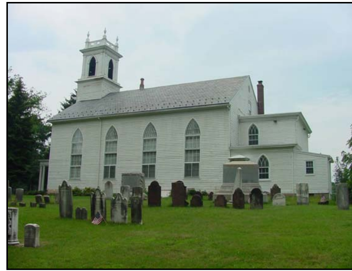
First Presbyterian Church of Hanover, East Hanover Township

Additional support of local historic commission and preservation group activities is often provided by local municipalities in the development of Historic Preservation Plan Elements in the local master plan. The Municipal Land Use Law permits the development of these master plan elements with the purpose of indicating the location and significance of historic sites and districts, identifying the standards that may be used to assess worthiness for historic site or district identification and to analyze the impact of other master plan elements on the preservation of historic sites and districts. At last count, at least 20 municipalities had Historic Preservation Plan Elements as part of their master plan. 6