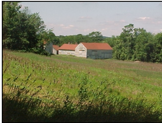
Morris County Preserved Farmland

The Morris County Farmland Preservation Program began with the permanent preservation of a 14 acre parcel in Washington Township in December of 1987. As of January 2007, 93 farms have been permanently preserved totaling 6,162 acres. 9 Other farms are currently in various stages of the easement purchase program. Nineteen additional farms are pending preservation that, when preserved, will add another 960 acres to farmland preservation totals. 10 Another six farms totaling about 530 acres are in the temporary “eight-year” preservation program.