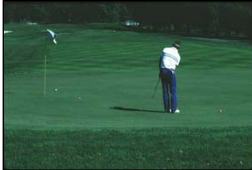
Pinch Brook Golf Course

There are currently 35 county park facilities owned and managed by the Park Commission, including traditional parks, golf courses, linear trail systems and indoor sports facilities. In all, these parklands total 16,322 acres, which are dedicated to recreation/cultural resources, open space and historic preservation. 7