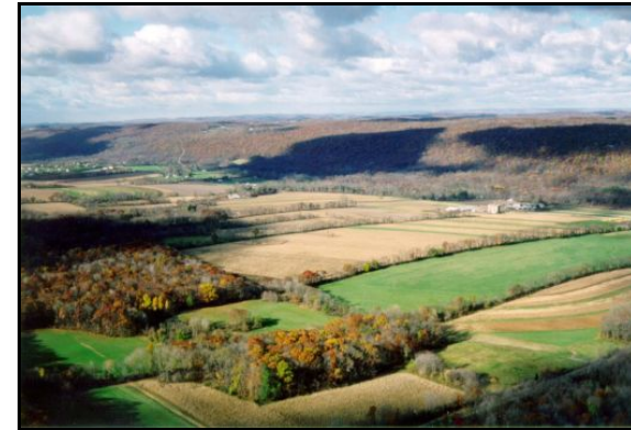
Long Valley Farmland and Open Space